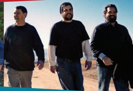
MAKEM AND SPAIN