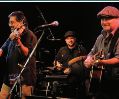
CORNEB BEEF & CURRY