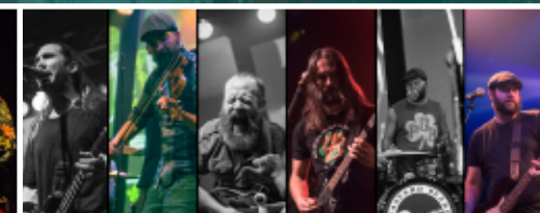
BASTARD BEARDED IRISHMEN