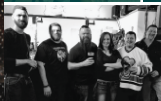
THE WILD GEESE