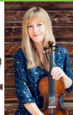
THE BOW TIDES