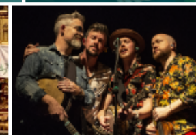
WE BANJO 3