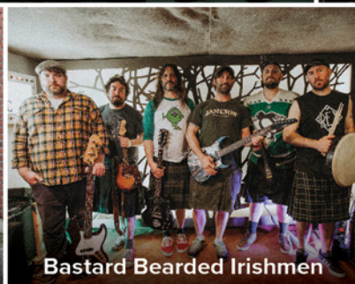
Bastard Bearded Irishmen