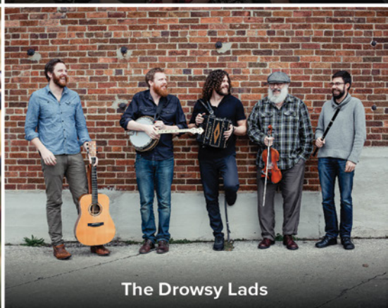
The Drowsy Lads