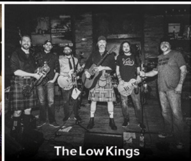
The Low Kings